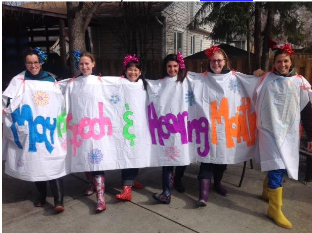
Yellowknife speech and language pathologists promote Speech and Hearing Month at a local Gumboot Rally fundraiser in 2014.

May is Speech and Hearing Month. Speech, language, and hearing are all linked to literacy. Children who have smaller vocabularies as preschoolers are more likely to struggle with learning to read. Children who have trouble pronouncing sounds can have difficulty learning to spell and sound out words. Children with undiagnosed hearing loss are at risk for reading and other academic delays. What can we do to put kids on the right track in these areas before they start school?... Read more