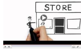
Fetal Alcohol and the Law - Part 2